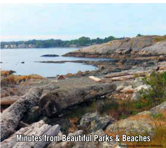
Minutes from Beautiful Parks & Beaches