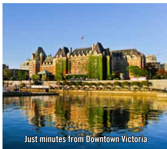
Just minutes from Downtown Victoria