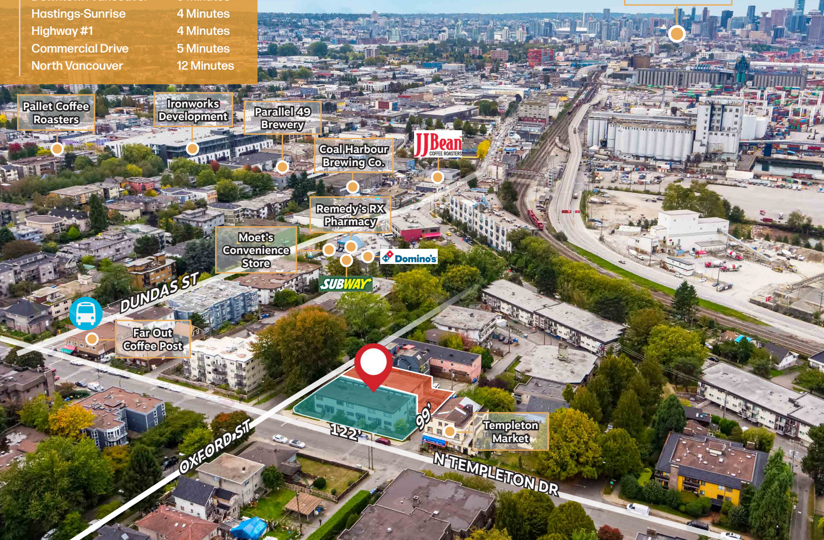
Example OF A 6-storey Rendering at 103 N Templeton & 2185 Oxford Street